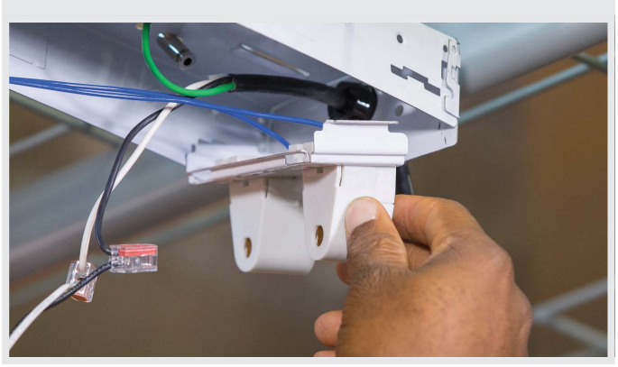
STEP 2: Cut the wire leads coming from the sockets and remove the sockets and socket bars on both ends of the fixture.