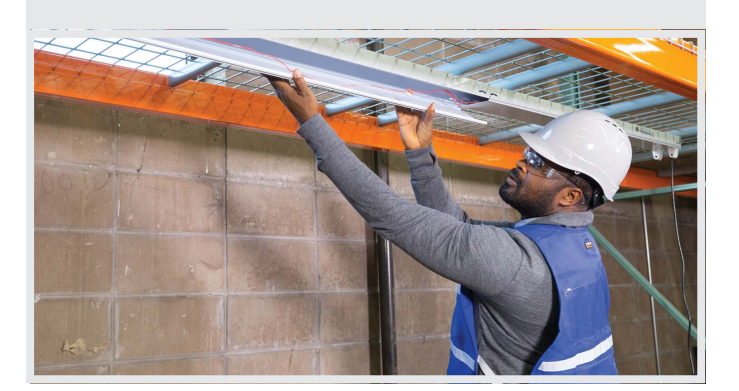
STEP 1: Shut off power to the fixture. Remove the existing fluorescent lamps and the ballast cover. Disconnect the ballast from the building's line voltage.