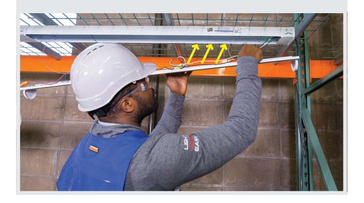
STEP 4: Connect power from building to quick disconnect on retrofit kit. Bring retrofit kit up to fixture frame.